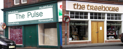
The Treehouse before and after

CARS has now been running for two years, and is part funded by Historic Scotland, Argyll & Bute Council and Highlands & Islands Enterprise (HIE). Following recent publicity in the Campbeltown Courier there has been an increase in interest, applications & grants received. So far there have been over 60 enquiries for grants. To date, seven applicants have been awarded grants. There are however, many still at the application stage. One example of a completed project is 'The Treehouse' shop front (pictured) on Longrow. In addition to this the Council aims to bring in a further £700,000 through a Townscape Heritage Initiative, Heritage Lottery Fund grant. If successful, grants may be offered from May 2009. To date two companies have been appointed to carry out appraisals. Gray, Marshall & Co are currently working on a Conservation Area Appraisal, Boundary Review and Management Plan. A local group chaired by Kate Singleton of Kintyre Civic Society supports this work. The Strathclyde Building Preservation Trust (SBPT) has almost completed their Options Appraisal report on the Old School at The Big Kiln.