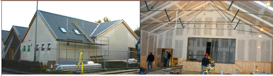
Tarbert Hall Outside and Inside

The stage will be greatly improved and a major innovation is a new facility for the Tarbert Youth Group to provide a permanent base for their activities.